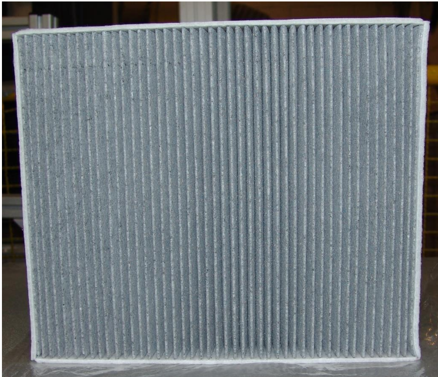
Figure 1: Upstream side of the Pleated Combi Filter Element – "Roger Dual Filter H12"

Figure 1 and Figure 2 show photographs of the tested Pleated Combi Filter Element.